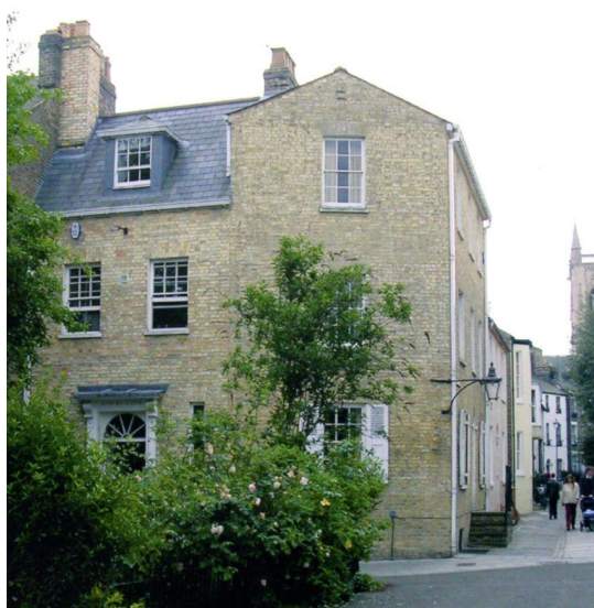
The Clubhouse, 18 Portugal Place

On 30 th October 1992, Prince Phillip, the Chancellor of the University, opened the new Clubhouse – we have been open for 15 years! A cause for celebration and looking forward. For, although the opening seems like only yesterday, we have had our ups and downs over that period and on occasion only the munificence of certain benefactors has kept us in the black. However we are now looking forward with increasing confidence, and this leader touches on some of the issues involved: