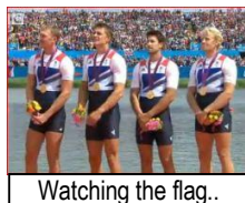
Watching the flag..

In other rowing results Tom Ransley (Hughes Hall) rowed to a bronze medal in the men's 8, while George Nash (St Catharine's) also gained a bronze in the men's pair. Anna Watkins (Newnham) won gold in the women's double sculls with Katherine Grainger, a three times silver medalist. In their extraordinary race they beat the runners-up by a full 2½ seconds.