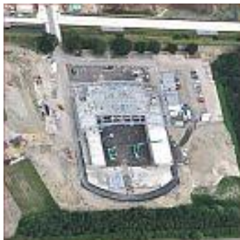
Aerial view - Cotton footpath at bottom

Over 70 individuals have donated to the project so far, with a handful of substantial contributions from alumni. As reported previously, the University has contributed £10m to the project which has allowed the building work to commence. Although great fundraising progress has been made, much more remains to be done and the search for a Naming Gift is now underway.